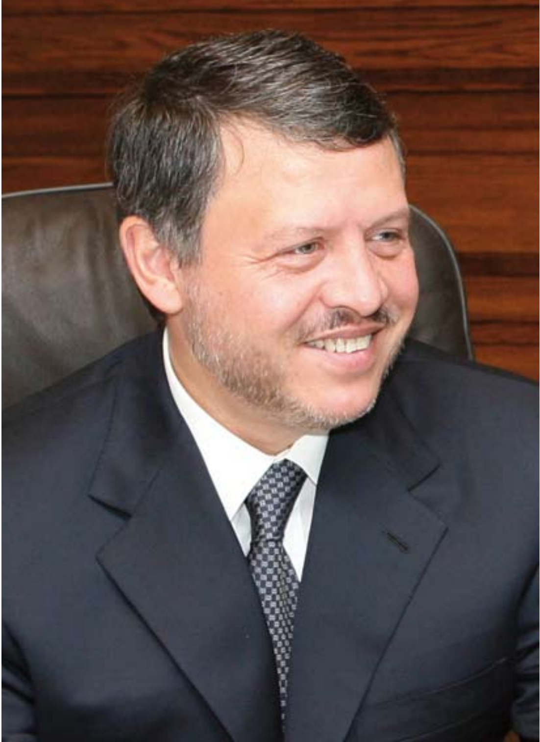
His Majesty King Abdulla II Bin Al-Hussein