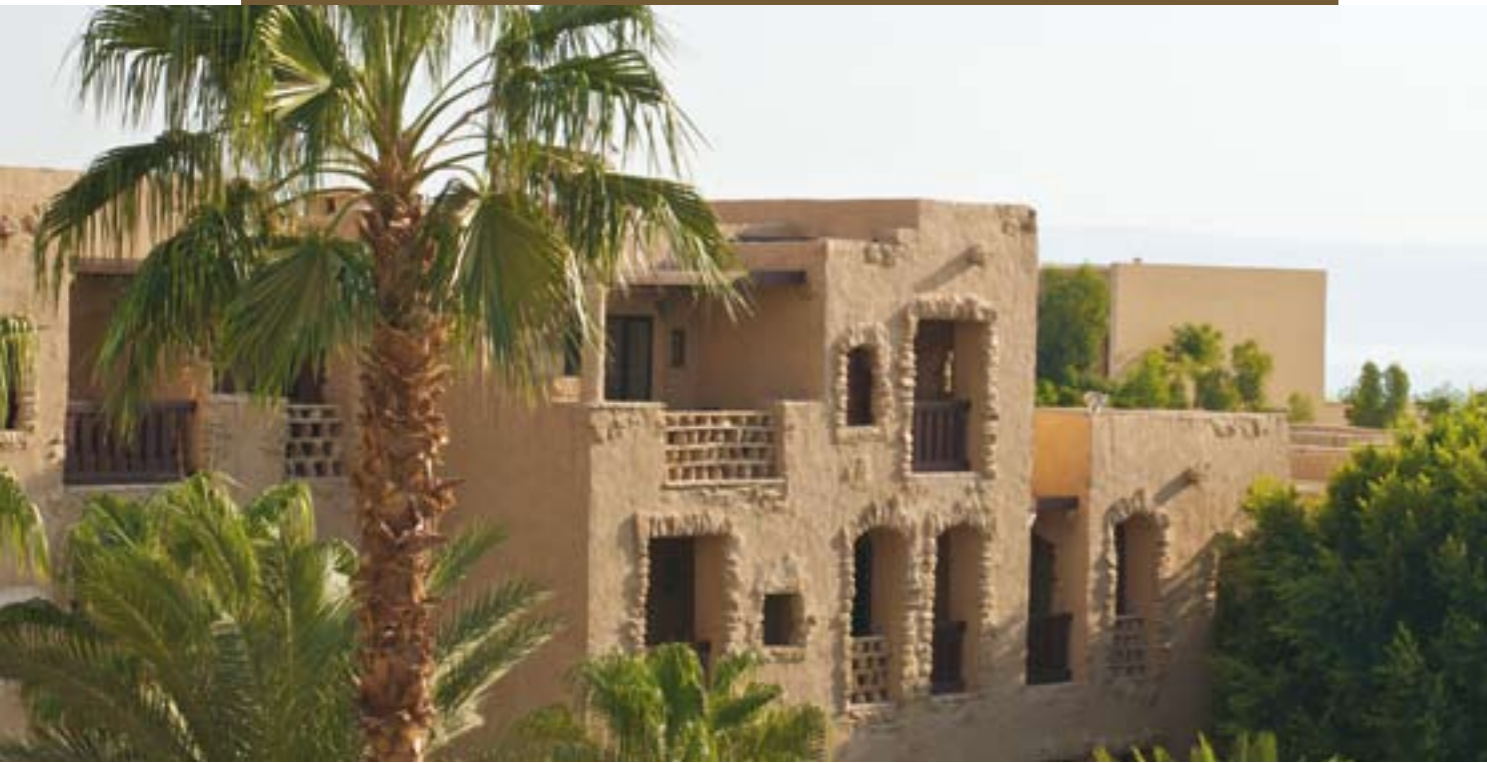
Mövenpick Resort & Spa Dead Sea