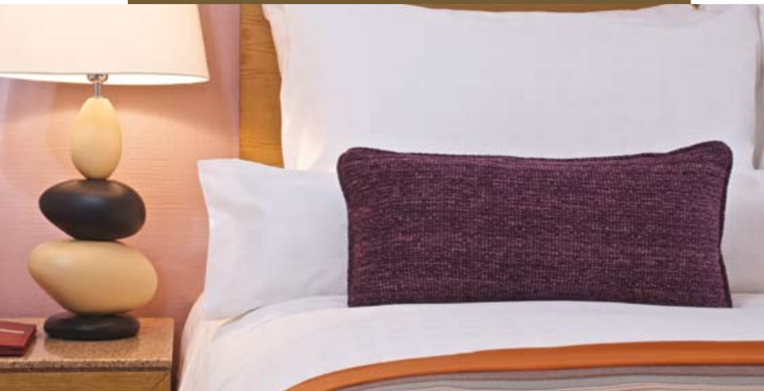
Mövenpick Resort Tala Bay Aqaba