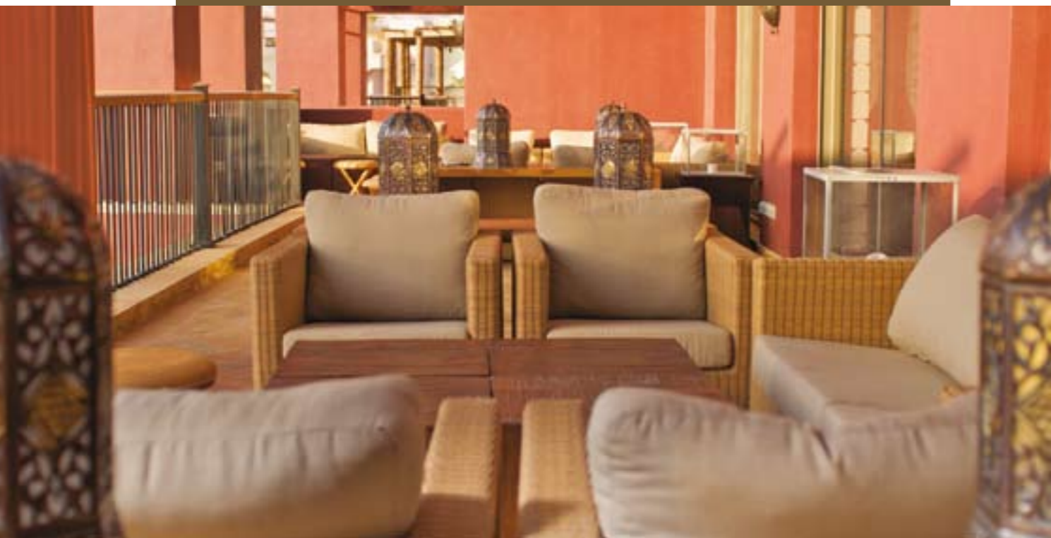
Mövenpick Resort Tala Bay Aqaba