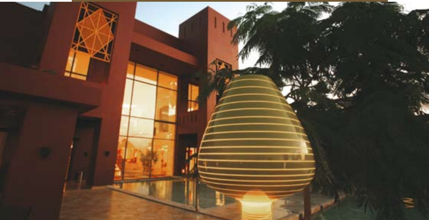
Mövenpick Resort Tala Bay Aqaba