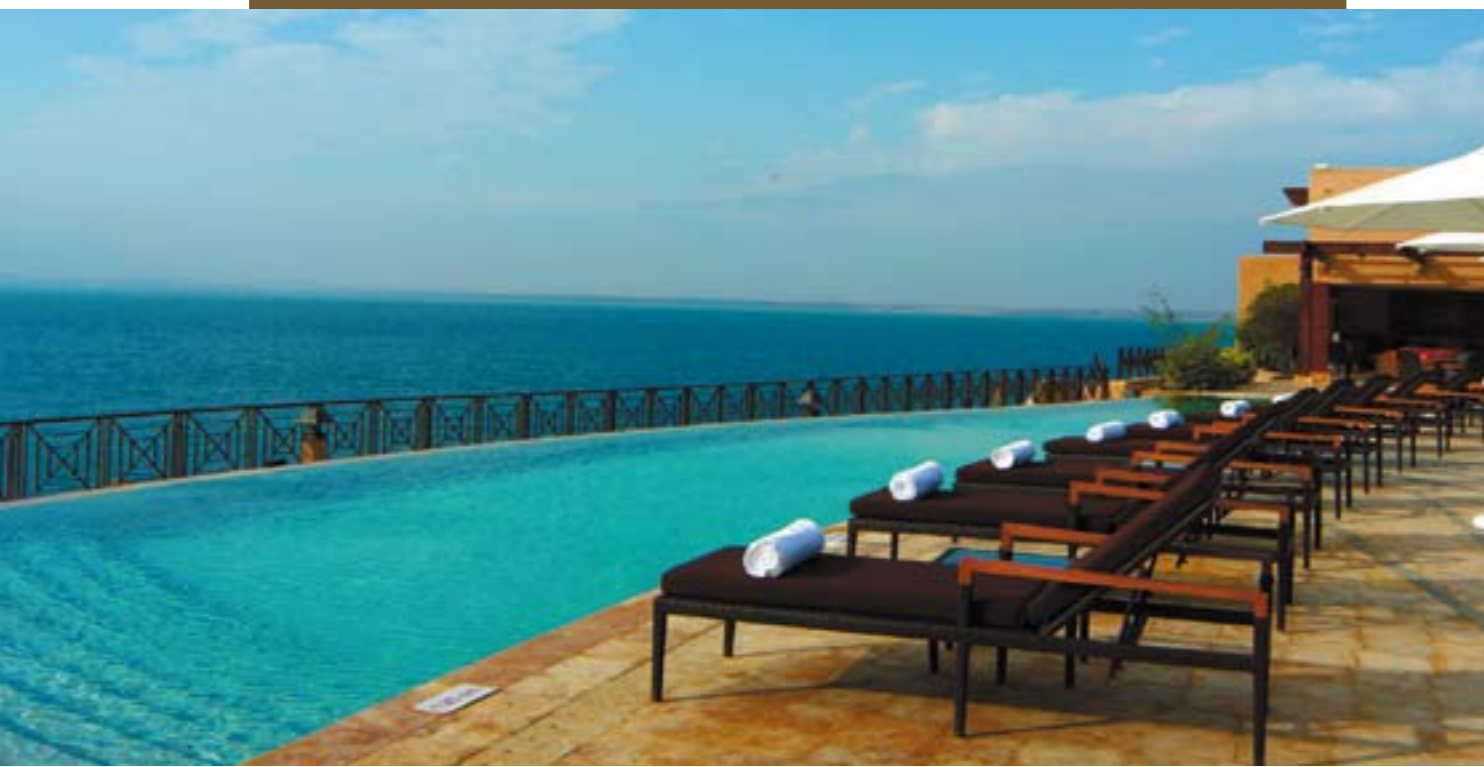
Mövenpick Resort & Spa Dead Sea