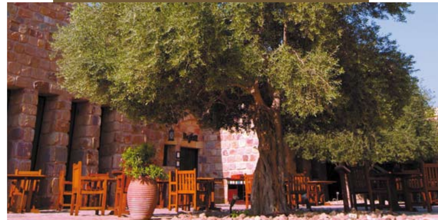
Mövenpick Resort & Spa Dead Sea