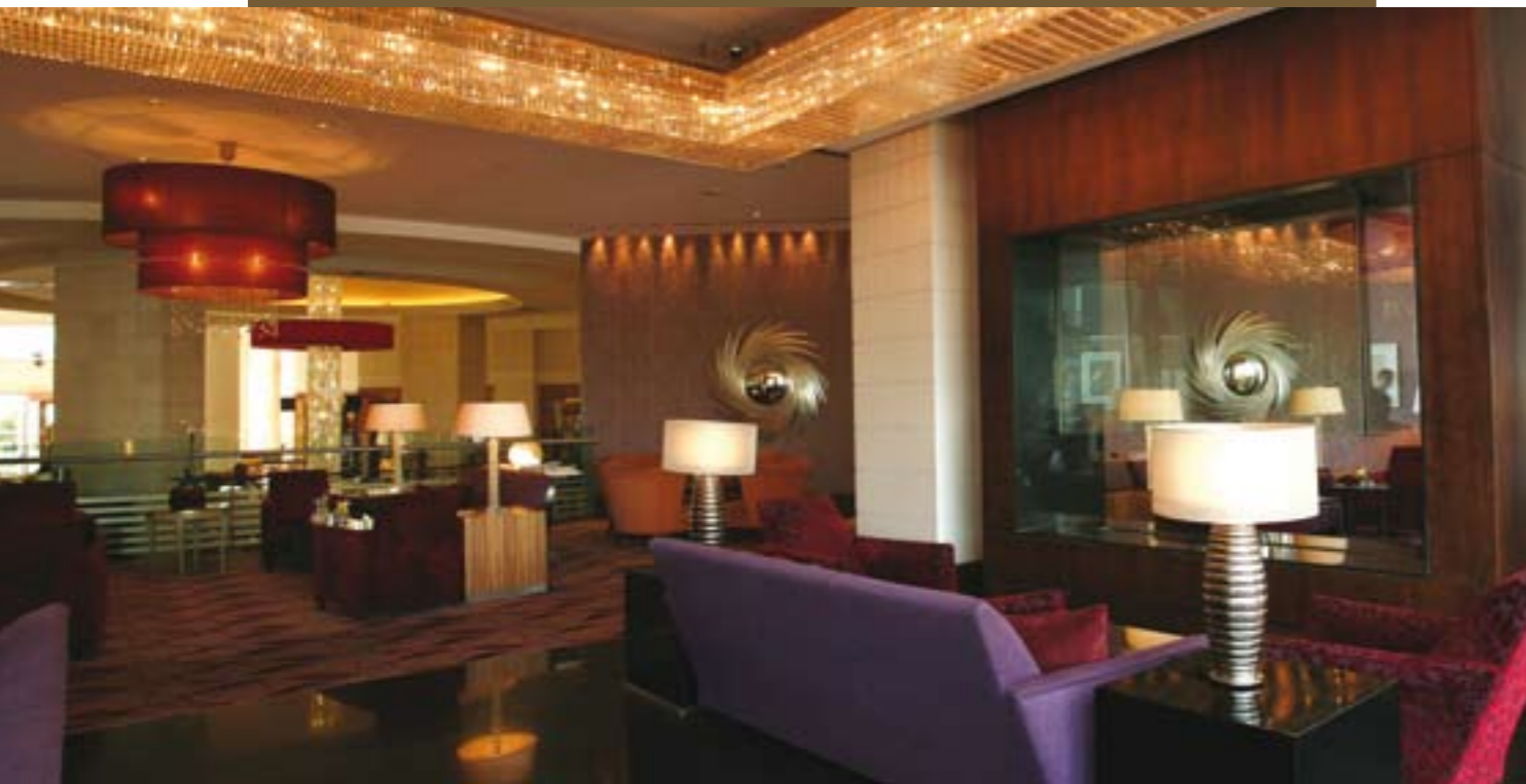
Grand Hyatt Amman