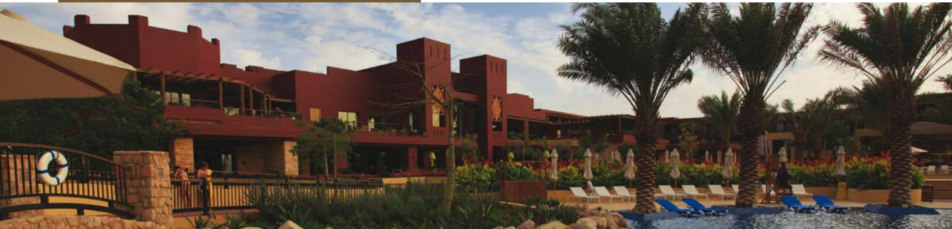
Mövenpick Resort Tala Bay Aqaba

The Board of Directors is pleased to welcome you and to present to you the 16th annual report on the Company's activities, the consolidated financial statements for the fiscal year ending 31/12/2009 and the outlook for 2010.